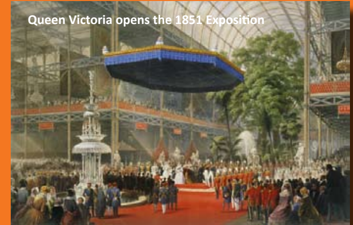
Queen Victoria opens the 1851 Exposition

The 2017 Australian Smart Communities Conference is equally important to Australia's future prosperity. It will follow on from the inaugural 2016 conference by emulating the World Exposition's vision to bring the marvels of modern technology alive and explain to delegates how they can take advantage of exciting new technology to benefit their communities and cities.